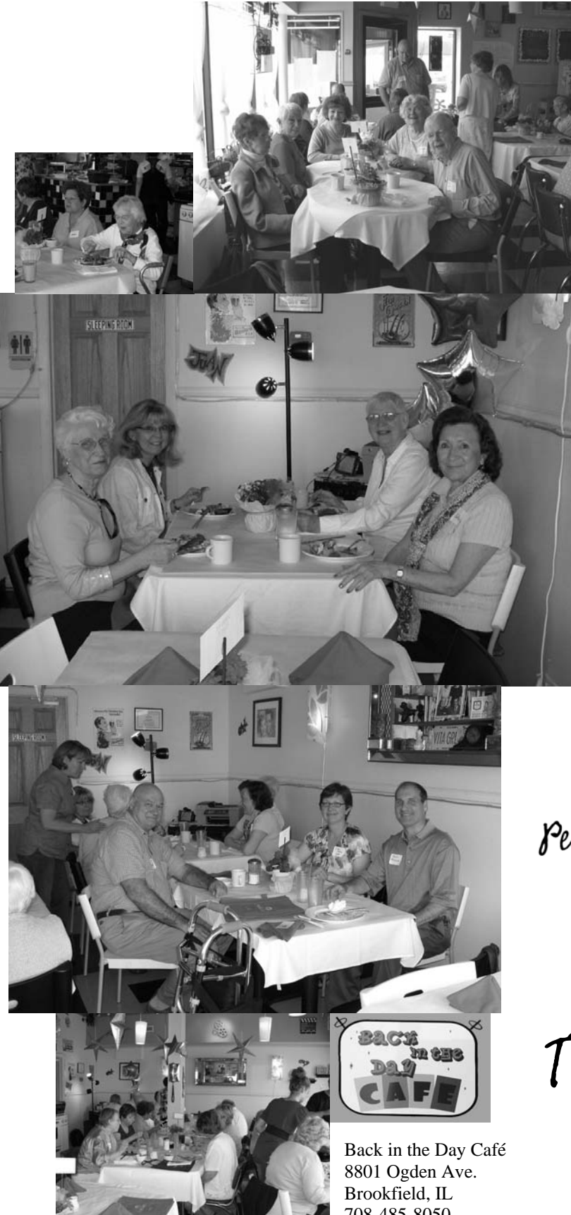
Back in the Day Café 8801 Ogden Ave. Brookfield, IL 708-485-8050

On Saturday, May 22, 2010, PeopleCare, Inc. held its Volunteer Appreciation Breakfast at the Back in the Day Café , in Brookfield. Thank you to all of our valuable volunteers for their time that they openly give.